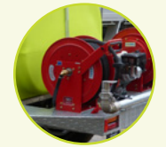
Spring Retractable Reel