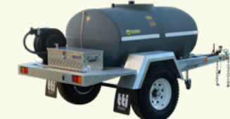
$11,343 1,000 Litres Braked/Registrable Single Axle