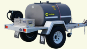
$8,533 1,000 Litres UnBraked/On-Farm Single Axle