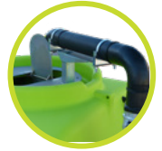
3" Hydrant Fill Lid