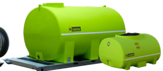
Water Cartage Tanks