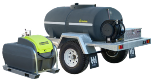
Diesel Transfer Equipment