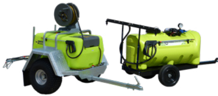
12v Spot Sprayers