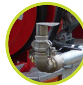
Deflector Spray Heads