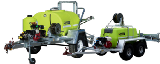
Trailed Field Sprayers