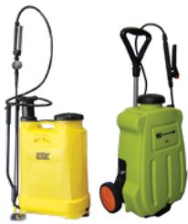
Backpack & Handheld Sprayers