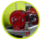
Spring Retractable Reel