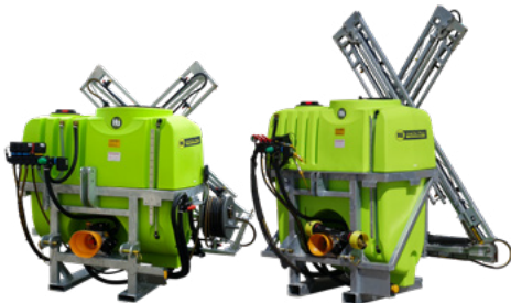
3-Point Linkage Sprayers