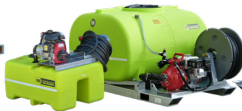
Fire Fighting Equipment