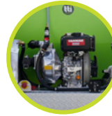
Electric Start Engine